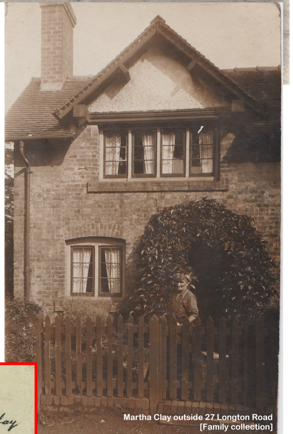
Martha Clay outside 27 Longton Road