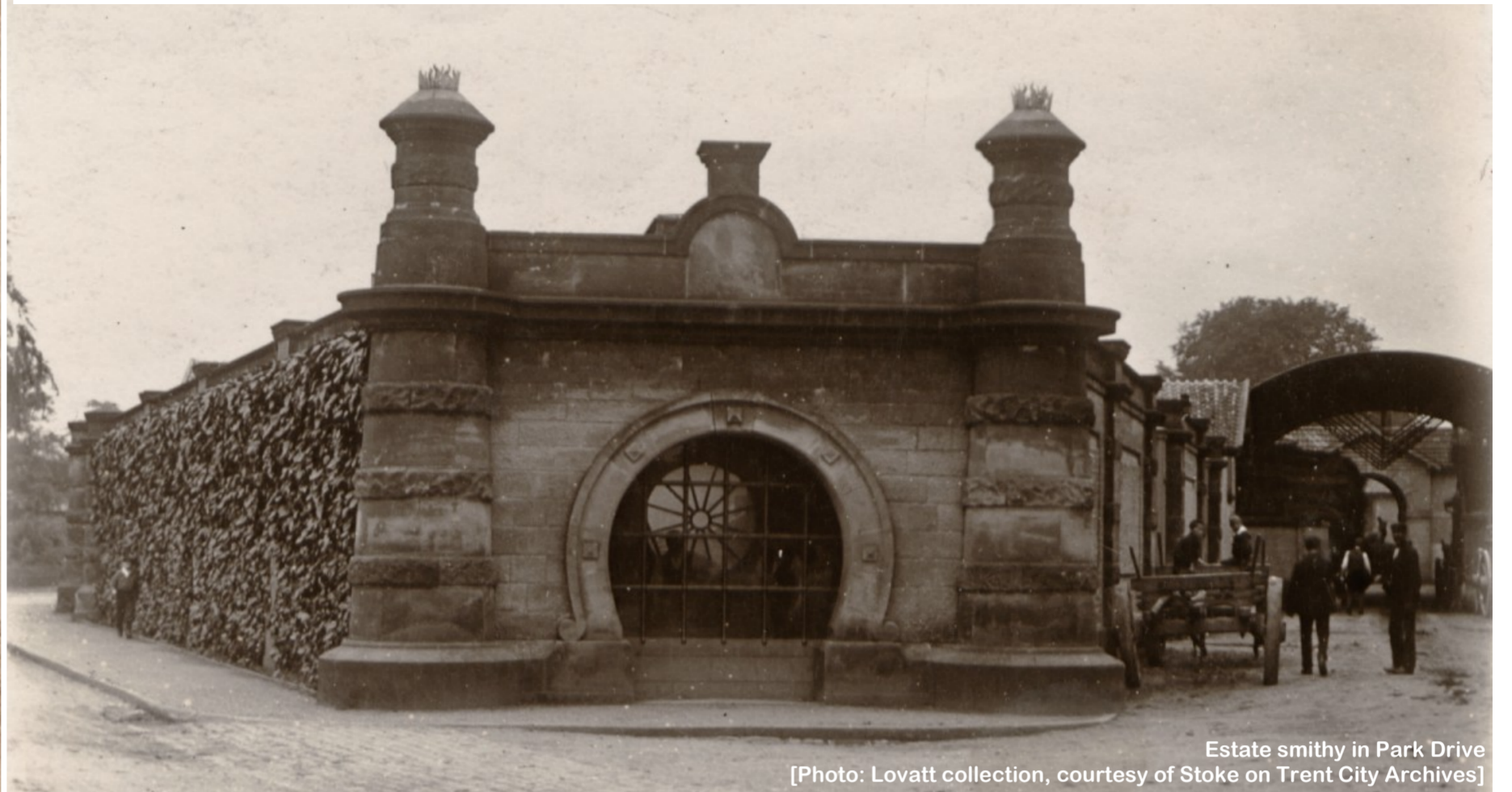
Estate smithy in Park Drive