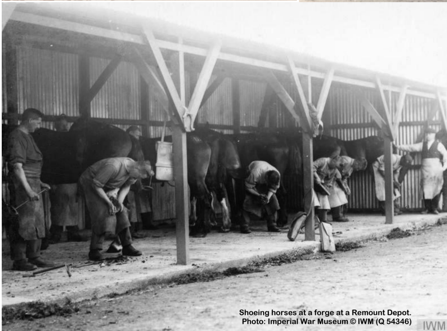
Shoeing horses at a forge at a Remount Depot.