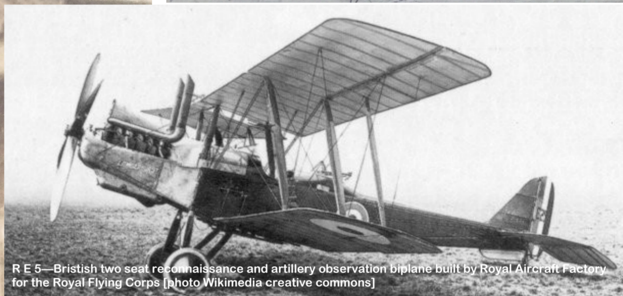
R.E.5—British two seat reconnaissance and artillery observation biplane built by Royal Aircraft Factory for the Royal Flying Corps

A page from Percy's engine testing book 1915.